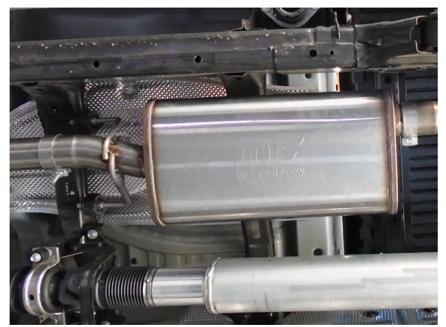
Step 4: Attach the Muffler Assembly by fitting it to the Extension Pipe (or Inlet Assembly) using the supplied 3.00" clamp and fitting the hangers into the rubber insulators.