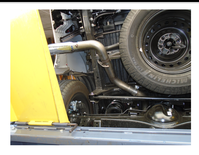
Step 6: Finish the installation by attaching the Tail Pipe Asembly to the Over Axle Pipe using the supplied 3.00" clamp and fitting the hanger into the rubber insulator.