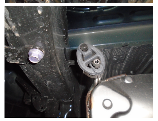
Step 1: To remove the OE exhaust system, loosen fasteners at the inlet flanges (2) where they connect to the catalytic converters. Working front to rear disengage the hangers from the rubber insulators, remove the remaining fasteners at flange junctions and drop the system. (Retain the Inlet fasteners, gaskets and rubber insulators as they will be used to install your new system.)