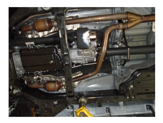
Step 2: Begin Installation of the new MagnaFlow system by attaching Passenger side Inlet Assembly using the OE fasteners and gaskets. Next install the Driver side in a similar fashion (using OE fasteners) and using a supplied 2.50" clamp attach it to the Passenger side inlet. (Leave all clamps and fasteners loose until final adjustment for fit.)