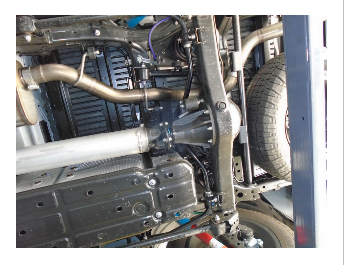
Step 5 : Next, attach the Overaxle pipe to the muffler Assembly using the supplied 3.00" clamp and fit the hangers.