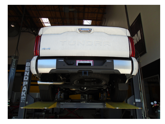
Step 7: Once a final position has been chosen for the new exhaust system, evenly tighten all clamps from front to rear using the torque specifications on page one of the instructions. Inspect all fasteners after 25-50 miles of operation and re-tighten if necessary.

MAGNAFLOW: 1901 Corporate Centre Dr - Oceanside, CA 92056 | 1(800)990-0905 Technical Support: 1(800) 959-9226 | Email: moreinfo@magnaflow.com