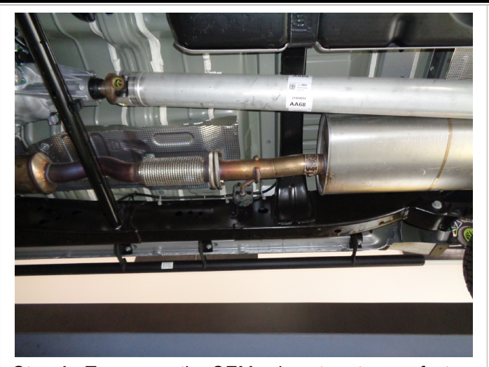
Step 1: To remove the OEM exhaust system, unfasten hardware at the muffler flange (Retain both flange fasteners to be re-used).