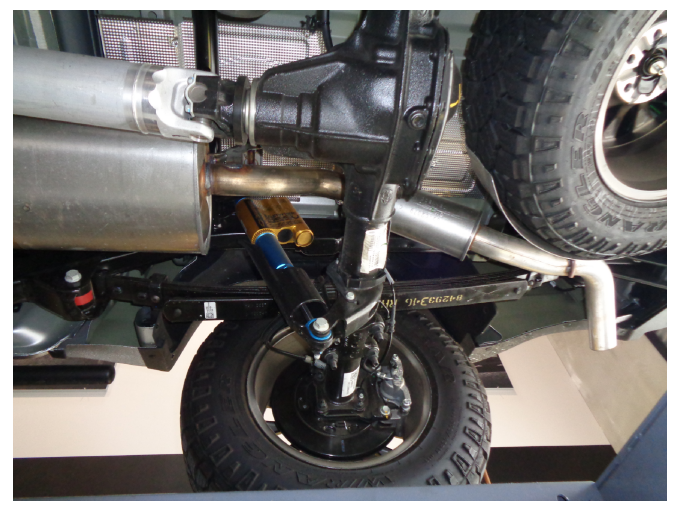
Step 2: Working front to rear, disengage all welded hangers from the rubber insulators and remove the system. (Retain the rubber insulators as they will be needed to mount the new MAGNAFLOW system.)