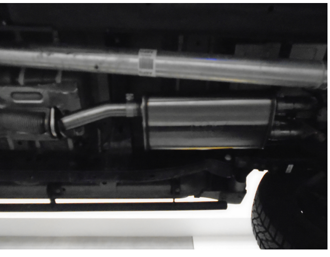
Step 4: Next attach the Oval Muffler to the Inlet Pipe with the supplied 2.50" clamp. This exhaust system is configured to allow the user to tune the sound. For a more moderate exhaust sound install the U-pipe Assy and the 4.00" NDT Chamber (as shown) using the suppled 2.50" clamps. For a more aggressive sound see configuration chart below.