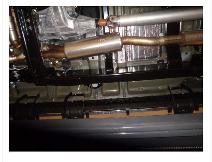
Step 2: Next loosen the clamp rearward of the OEM resonator. Detach all welded hangers from the rubber insulators. The system may now be removed. Be sure to retain all mounting hardware as it will be needed to install your new MAGNAFLOW system