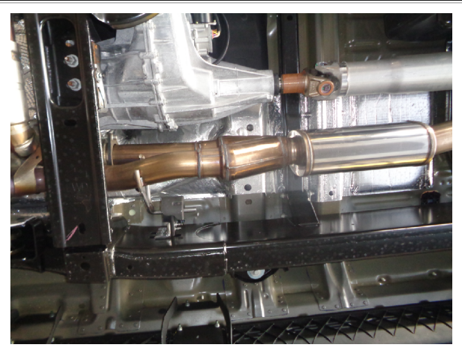
Step 4: Begin installing your new system by loosely attaching the Muffler Assembly to the catalytic converter outlet pipes using the OEM hardware. Engage the welded hanger to the rubber insulator.

LWB = Long Wheel Base SWB - Short Wheel Base