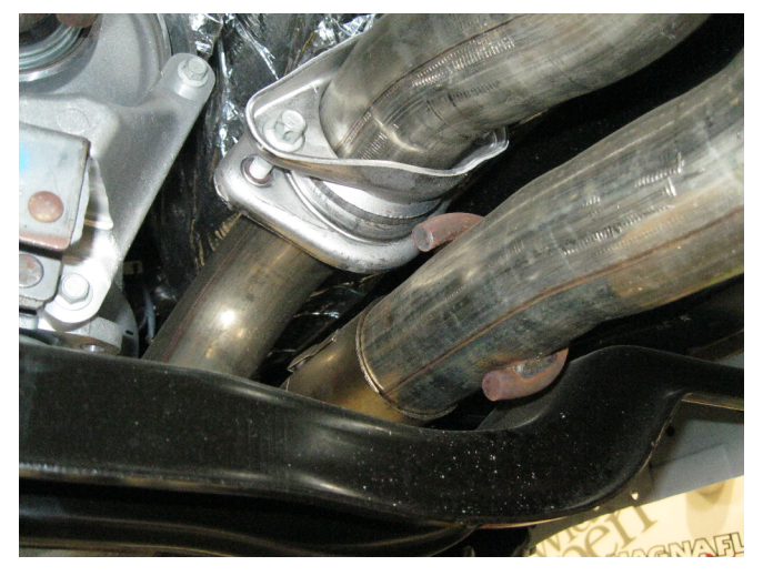
Step 1: To remove the OEM system loosen the clamp at the inlet pipe junction to the catalytic converters. Next, unbolt the flange coupling at the other inlet pipe.