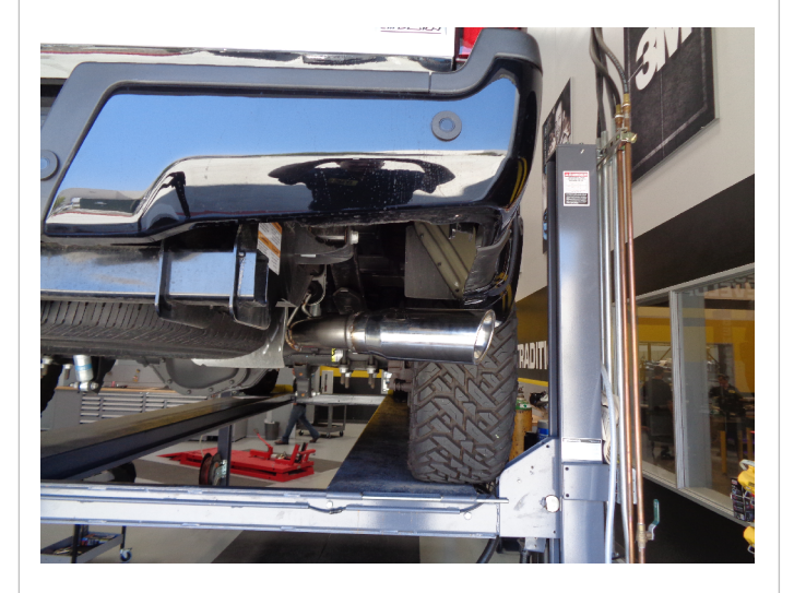
Step 7: Once a final position has been chosen for the new exhaust system, evenly tingten all clamps from front to rear using the torque specifications on page one of these instructions. Inspect all fasteners after 25-50 miles for operation and re-tighten if necessary.

MAGNAFLOW: 1901 Corporate Centre Dr - Oceanside, CA 92056 | 1(800)990-0905 Technical Support: 1(800) 959-9226 | Email: moreinfo@magnaflow.com