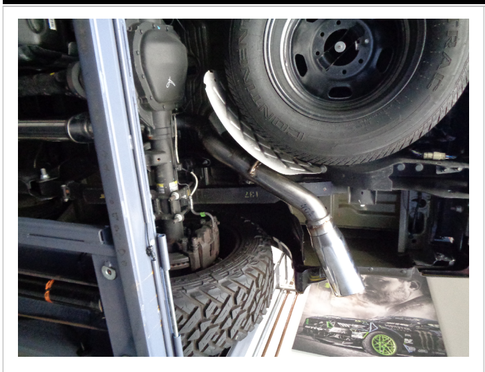
Step 6: Finish by loosely attaching the Tail Pipe Assembly using the supplied clamp. Install the welded hanger to the rubber insulator.