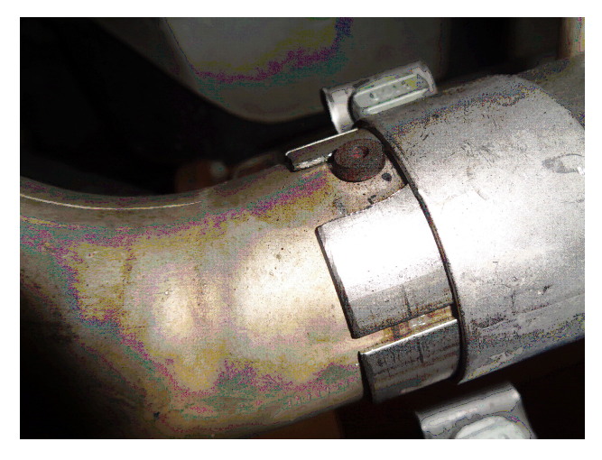
Step 2: To install the MagnaFlow Muffler Assembly slide the inlet onto the OE outlet making sure to align the slot with the peg on the outlet pipe. Secure with the supplied 3.00" clamp.