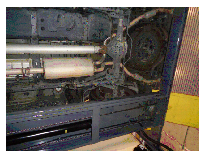
Step 1. Begin removal of the OE muffler by loosening the three clamps attaching the exhaust to OE system. Disengage the hangers from the rubber insulators and remove the muffler. Do not discard or damage the rubber insulators as they will be used to install the new system.