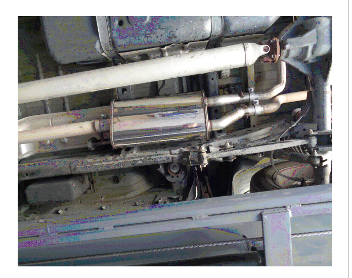
Step 4: Finish by fitting the OE tailpipes into the Muffler Assembly by indexing the alignment pegs and securing with the supplied 2.25" clamps. Once a final position has been chosen for the new exhaust system, evenly tighten all clamps from front to rear using the torque specifications on page one of these instructions. Inspect all fasteners after 25-50 miles for operation and re-tighten if necessary.

MAGNAFLOW: 1901 Corporate Centre Dr - Oceanside, CA 92056 | 1(800)990-0905 Technical Support: 1(800) 959-9226 | Email: moreinfo@magnaflow.com