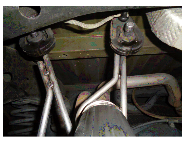
Step 3: insert the welded hangers into the rubber insulators