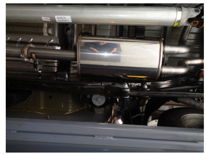
Step 3: Install the new system by attaching the muffler assembly to the resonator pipe assembly with supplied hardware and gasket.

Step 2: Working front to rear disengage all welded hangers from the rubber insulators and remove the system. (Retain the insulators as they will be needed to mount the new MAGNAFLOW system.)