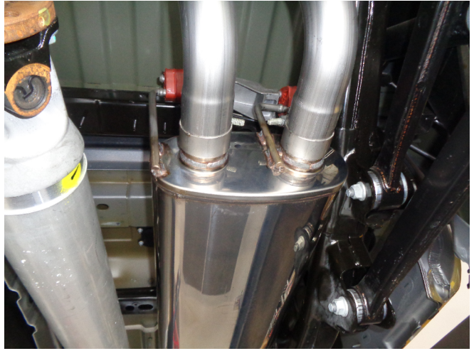
Step 4: Locate the welded hangers to the rubber insulators. Leave all clamps loose for final adjustment of the complete syste once installed.