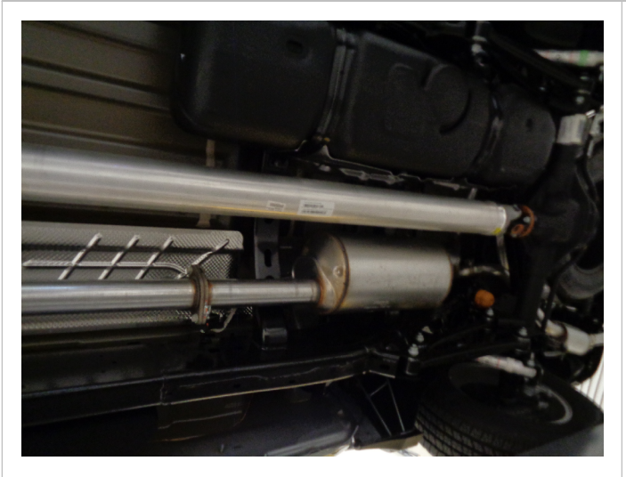
Step 1: To remove the OEM exhaust system, loosen hardware at the muffler flange.