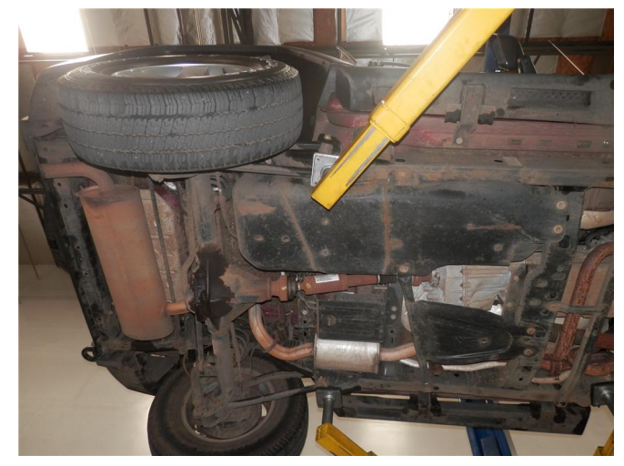
Step 2. Disengage hangers from rubber insulators and remove the OEM exhaust.

Step 1. Begin removal of the OEM exhaust system by loosening the band clamp attaching the exhaust to the catalytic converter. Do not discard or damage the OEM fasteners or rubber insulators as they will be used to install the new system.