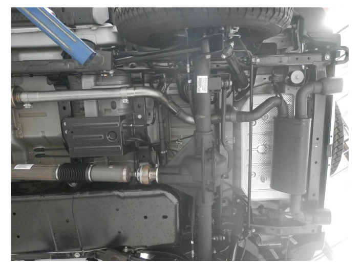
Step 5. Next loosely install the Over-Axle Pipe Assembly and the Muffler Assembly using the supplied clamps. Locate all welded hangers to the rubber insulators.

MAGNAFLOW: 22961 Arroyo Vista - Rancho Santa Margarita, CA 92688 | 1(800) 990-0905 Technical Support: 1(800) 959-9226 | Email: moreinfo@magnaflow.com