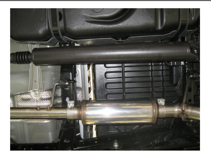
Step 4. Next use the supplied 2.50" clamps to attach the Muffler Assembly to the Inlet Pipe and the Tailpipe Assembly to the Muffler Assembly. Complete by fitting the hangers on the Tailpipe into the insulators.