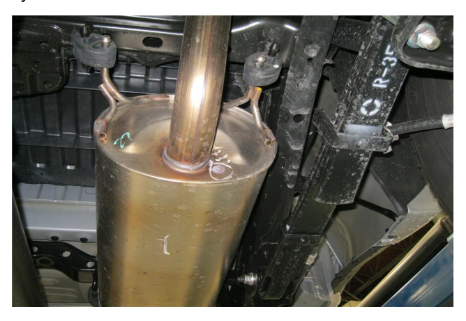
Step 2. Disengage hangers from rubber insulators and remove the OEM exhaust.