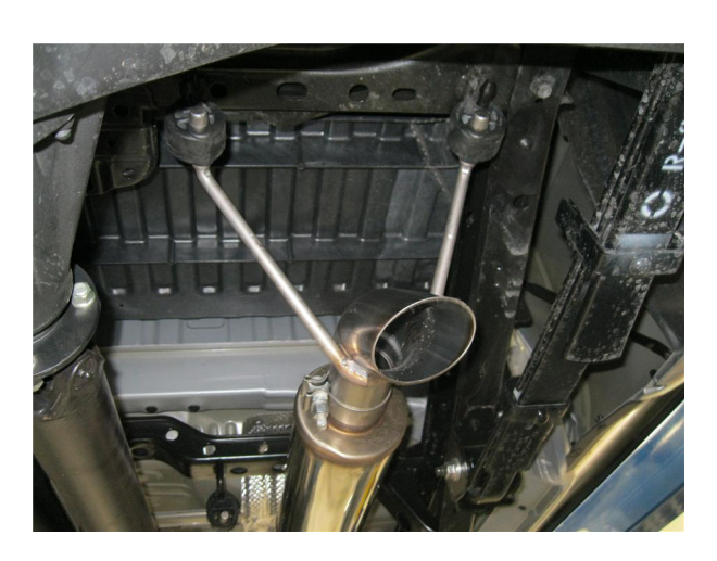
Step 5. Once a final position has been chosen for the new exhaust system, evenly tighten all clamps from front to rear using the torque specifications on page one of the instructions. Inspect all fasteners after 25-50 miles of operation and re-tighten if necessary.