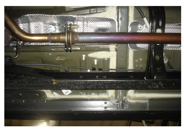
Step 1. Begin removal of the OEM exhaust system by unbolting the two spring loaded bolts attaching the exhaust to the catalytic converter. Do not discard or damage the OEM fasteners or rubber insulators as they will be used to install the new system.