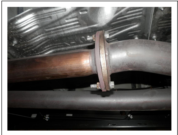
Step 1. To begin the removal of the OEM system you will need to remove the spare wheel. Next unbolt both inlet flanges at the OEM inlet ipie assembly. Working rearward (with the exhaust supported) extract the hangers from the rubber insulators and remove the OEM exhaust. Do not discard or damage the rubber insulators as they will be used to install the new exhaust system.