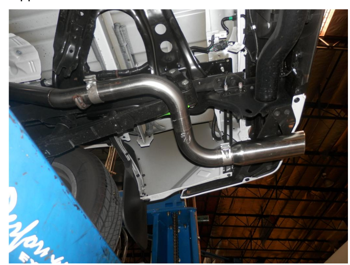
Step 4. Attach the Tail Pipes to the system using the supplied 2.50" clamps. Install the tips using a similar fashion.