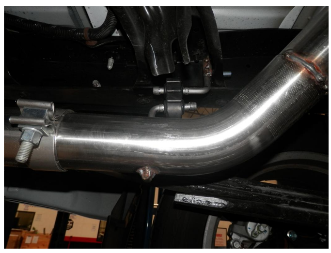
Step 3. Attach the supplied Hanger Bracket Assembly to the vehicles subframe using the Bracket Plate and supplied hardware. There is an existing hole in the subframe located on the drivers side. Loosely install both Inlet Pipes to the muffler Assembly using the supplied 2.50" clamps and engaging the welded hangers to the rubber insulators. Install the Mid Pipe Assembly in a similar fashion locating the welded hanger to the Hanger Bracket Assembly you previouisly installed using the supplied Rubber Insulator.