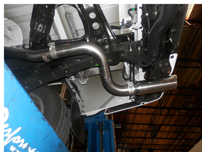
Step 4. Attach the Tail Pipes to the system using the supplied 2.50" clamps. Install the tips using a similar fashion.