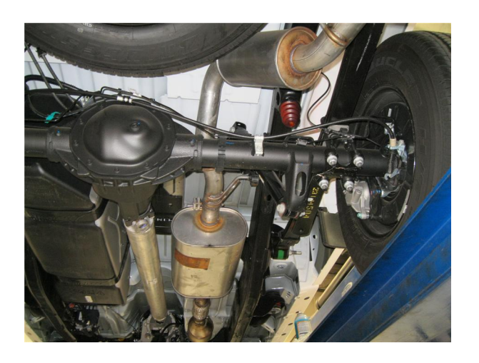
Step 1. To remove the OEM exhaust system, you will first need to cut the pipe behind the muffler before it goes over the axle. You can then disengage the welded hangers from the rubber insulators and remove the tailpipe. Unfasten the muffler inlet from the catalytic converter at the clamp junction. Do not damage or discard the OEM fasteners or rubber insulators, as they will be reused to mount the new system. Disengage the muffler hangers and remove it from the vehicle.