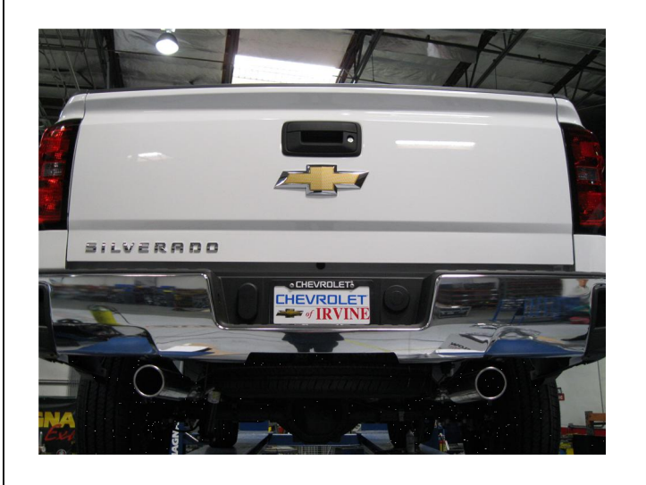
Step 5. Once a final position has been chosen for the new exhaust system, evenly tighten all clamps from front to rear using the torque specifications on page one of the instructions. Inspect all fasteners after 25-50 miles of operation and re-tighten if necessary.