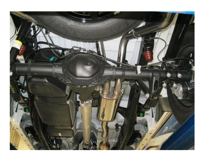
Step 4. Working front to rear install the remaining pieces of the MAGNAFLOW system, inserting hangers into rubber insulators and loosley intstalling suppled clamps. Adjustable tips are supplied to fit a variety of aftermarket bumpers and rollpans, once a position is decided for the tips it is recommended to have them welded into place.