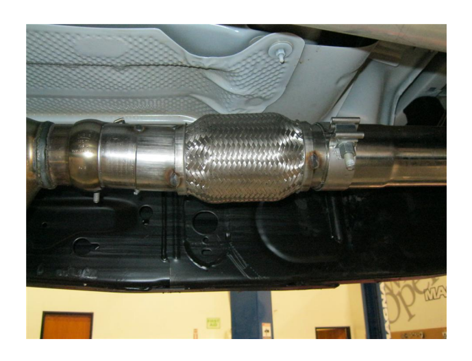
Step 3. Install the new Inlet Pipe Assembly at the ball flare using the OEM clamp. Leave all clamps and fasteners loose for final adjustment of the complete system.