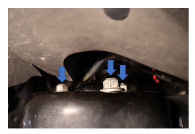
Step 9. Remove the shock absorber and spring assembly upper nuts.