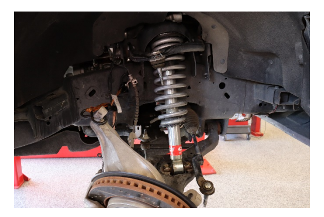
Step 6. Secure the spindle so that there is no tension in the brake line.