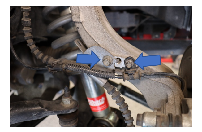
Step 1. Loosen and remove the wheel speed sensor bolt along with the brake hose bracket bolt and set them aside.