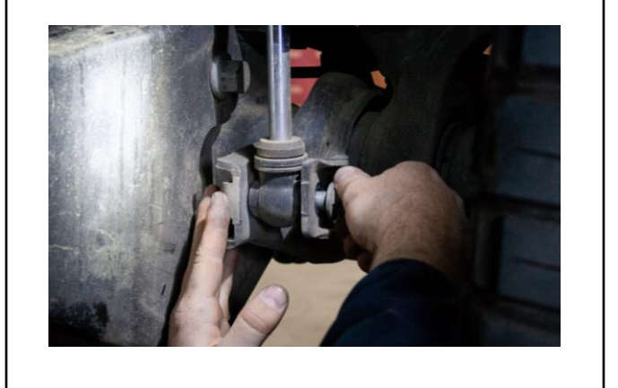
Figure 16A: Front Lower Shock Mount

6. Before starting this step, it is recommended to get another person to assist you. Align both front shock bottom eyelets into lower shock mount shackle. Slowly lower the vehicle until the lower shock eyelets are aligned with the shackle mounting hole (Figure 16A). Re-install the OE bolt and locking nut plate, then torque to OE torque specifications (Figure 16B).