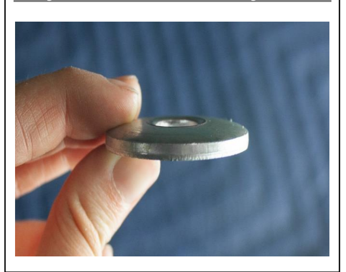
Figure 15A: Concave Shock Mounting Washer