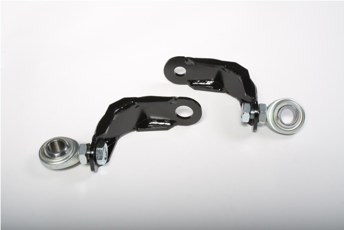
Figure 1: Pitman arm bracket on left, Idler arm bracket on right