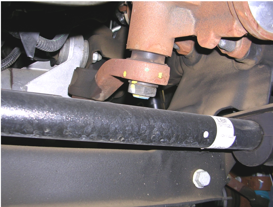
Figure 4: pitman arm