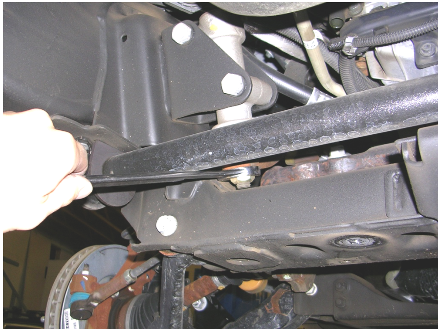
Figure 2: idler arm