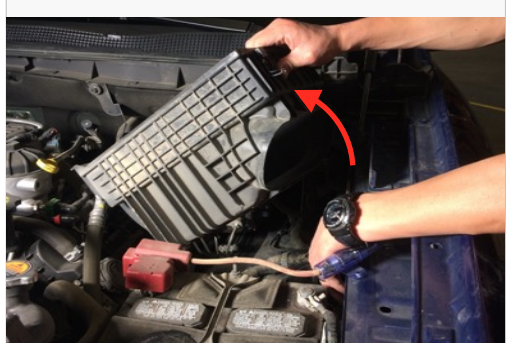
11. Remove the stock fender inlet from the vehicle.

12. Remove the bushing and grommet from the stock air box and install it into the Air Box (A). Remove the bushing first and then the grommet. Install in reverse order.