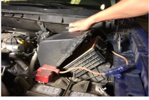
SEE EXPLODED VIEW ON PAGE 5