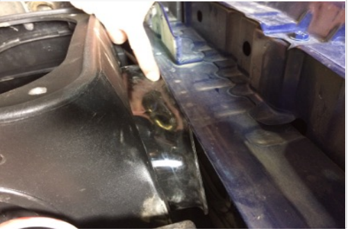
23. Install the Coupler (Q) and Intake Tube (D) onto the turbo inlet. Tighten the #60 and #56 Hose Clamps (J & K).

21. Insert the Intake Tube (D) into the air box up until it reaches the stopper.