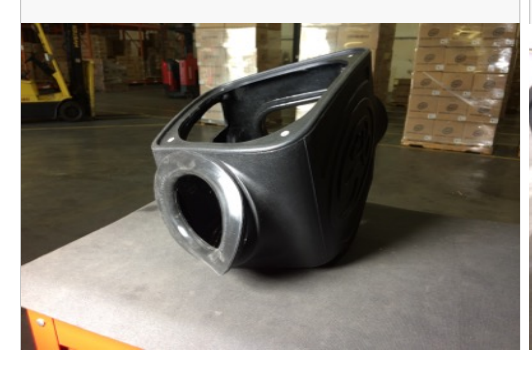
16. Determine whether or not you want the Box Plug (P) installed on your Air Box (A) For those concerned about minimal engine heat; insert the box plug into the side of the air box. For those seeking additional air flow, set the box plug aside. Note: the box plug can be installed/removed with the intake kit fully installed.

15. Press the two Grommet (E) onto the bottom of the Air Box (A).